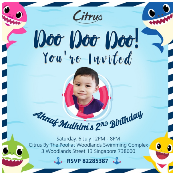
Customized E-Invitation & Cake